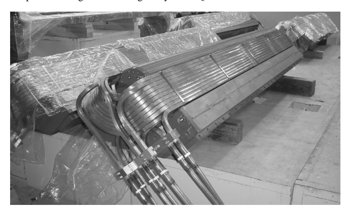
Fig. 4, New QC2 coils made of MIC mounted on the existing iron yoke. Old QC2 coils insulated by epoxy was removed and stored for future recirculation.

The coil windings by the MIC were essentially no problem. However, it took unexpectedly large labor cost to treat the coil terminals to fit the coil terminal shape to the water manifold. The price of the MIC coil is, then, more than twice of the