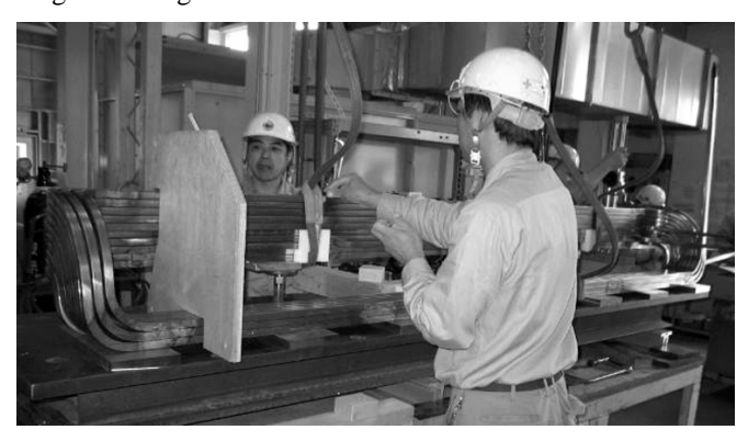
Fig. 3, One quadrant of Q350 (QC2) coil made of MIC at the final inspection. Coil dimensions were carefully checked by using the standard plate referring to the existing iron yoke of QC2.

MIC magnets are employed at the most upstream part of the external beam line, where the strong beam halo from the extraction devices of the accelerator should be unavoidable. Several large bending magnets also employed the MIC coil since the scattered beam generated along the beam line should be swept out there. Some magnets placed at the just upstream part of the main production target, T1, and all the downstream magnets from T1 are MIC magnets. Very severe radiations generated by the T1 can not allow any organic materials to be used in the neighboring locations of T1. The magnets at the downstream of the T1 are newly constructed ones since the radiation situation should be the worst there. The other MIC magnets are assembled with the used iron yokes as shown in Fig. 3 and Fig. 4 in order to reduce costs.