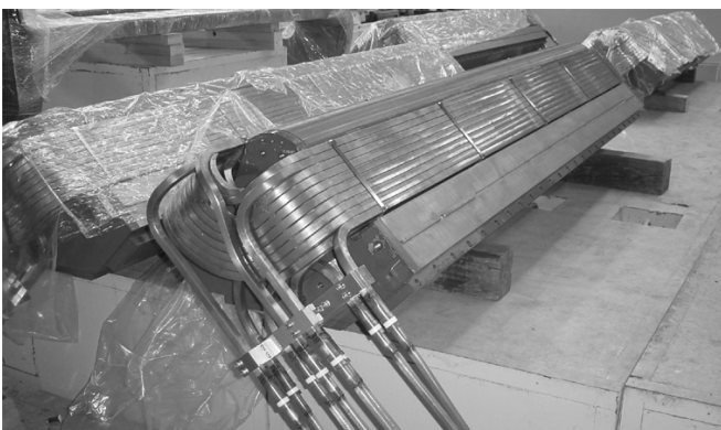
Fig. 4. New QC2 coils made of MIC mounted on the existing iron yoke. Old QC2 coils insulated by epoxy was removed and stored for future recirculation.

The coil windings by the MIC were essentially no problem. However, it took unexpectedly large labor cost to treat the coil terminals to fit the coil terminal shape to the water manifold. The price of the MIC coil is, then, more than twice of the