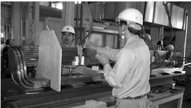
Fig. 3. One quadrant of Q350 (QC2) coil made of MIC at the final inspection. Coil dimensions were carefully checked by using the standard plate referring to the existing iron yoke of QC2.

MIC magnets are employed at the most upstream part of the external beam line, where the strong beam halo from the extraction devices of the accelerator should be unavoidable. Several large bending magnets also employed the MIC coil since the scattered beam generated along the beam line should be swept out there. Some magnets placed at the just upstream part of the main production target, T1, and all the downstream magnets from T1 are MIC magnets. Very severe radiations generated by the T1 can not allow any organic materials to be used in the neighboring locations of T1. The magnets at the downstream of the T1 are newly constructed ones since the radiation situation should be the worst there. The other MIC magnets are assembled with the used iron yokes as shown in Fig. 3 and Fig. 4 in order to reduce costs.